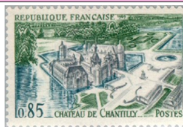
Castle of Chantilly (Oise)

It is the first dam built with a pure vault with spiral-shape horizontal arches.