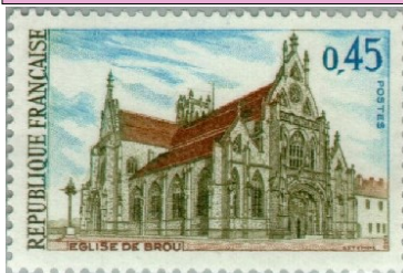
Church of Brou at Bourg en Bresse