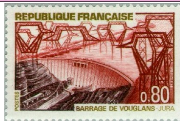
Dam Vouglans (Jura)

The royal monastery of Brou is formed of monastic buildings arranged around a church and three cloisters. This church is a flamboyant Gothic masterpiece, unique in France.