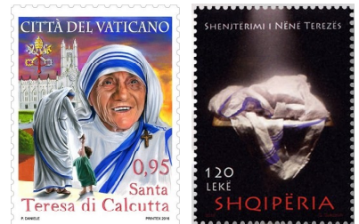
Vatican and Albanian Stamp Canonization of St. Teresa