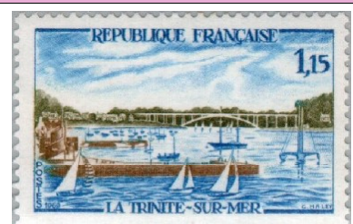
La Trinité sur Mer. the marina

The château, on a small rocky island in an artificial lake, was built in the 14th century and has since been restored several times. Now housing the Musée Condé, reportedly the best museum of art in all France, in 1886 it was bequeathed, together with its collections of the museum, library, and surrounding park, to the Institut de France by the duc d'Aumale.